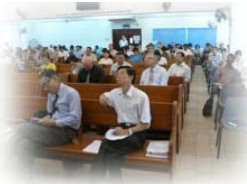
AGM last Sunday